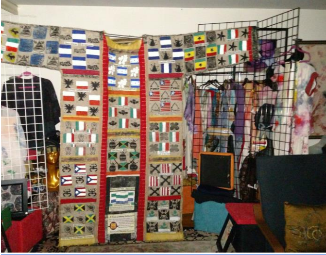
1. The Bellport High School Coat of Many Cultures™ - A creative collaboration between Textile Artist, Madona Cole-Lacy, and Students of Bellport High School